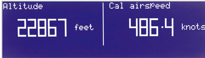
Dual channel aeronautical display