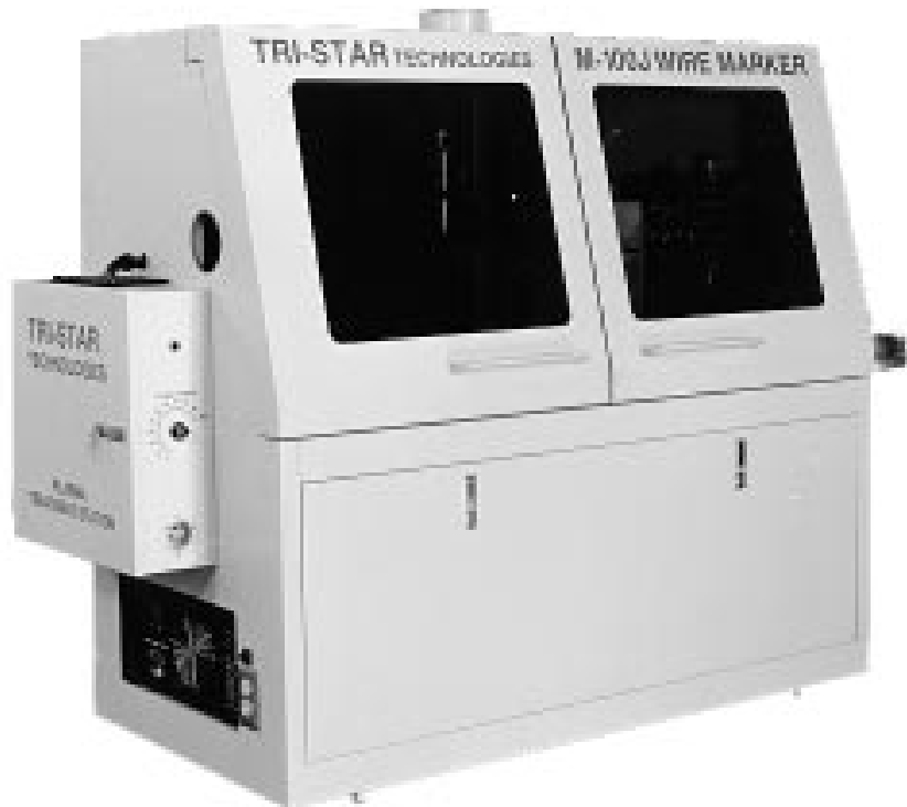
M-100J Ink Jet Wire & Cable Marker

T he M-100J is a fully automatic, computer controlled, high speed ink jet wire and cable marking system. This new and unique wire processing system is the first in the industry to integrate an in-line plasma pre-treatment system. This proprietary plasma device not only enhances the quality and durability of the mark, but it also gives the M-100J the ability to print on almost any wire insulation material, including fluoropolymers (Tefzel, Teflon, etc.)