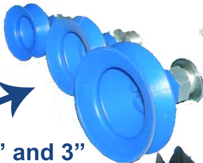
Optional 1", 1.5", 2" and 3" Cups (3" not shown)