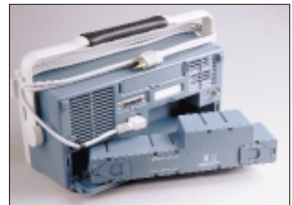
TDS 3BAT – Battery Pack being installed.

Converts ITU-R BT.601 format serial digital video to analog video. Automatically detects and displays 525/60 and 625/50 formats. Provides composite and component (RGB, YPbPr, or YC) outputs. Provides auto equalization for cable lengths up to 250 m and EDH and counting for incoming SDI signal. Adds video picture mode with on-screen line select and vectorscope mode with 100% and 75% color bars. Adds triggering and vectorscope graticules for analog HDTV. Includes full functionality of TDS 3VID Extended Video Applications module. Includes special output cable and four 75 \Omega terminators. Ships with Quick Reference and User Manuals in 10 languages. (Russian not available.)