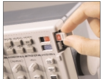
Application Module being installed.