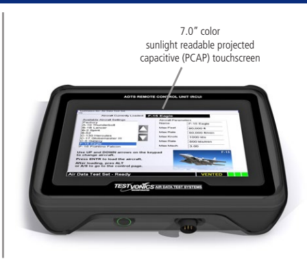
New! Tablet style Remote Control Unit (available 2019)