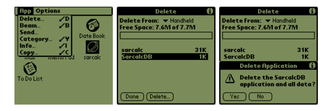
Deleting Database Screen Views

The number of records kept can be changed by selecting "Prefs" from the initial Sarcalc screen (see "Preferences"). The database can be erased by deleting the database "SarcalcDB" from the main Meazura screen as shown below. Tap the upper left-hand corner of the main screen to show the "App" pull-down screen, select "Delete" and then select "SarcalcDB" to delete. Individual records cannot be erased.