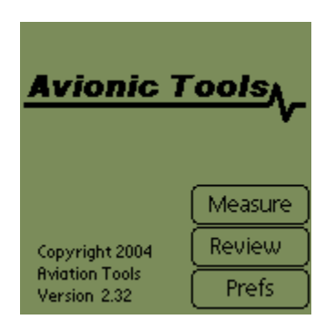
Software Screen View

The reader is now ready to receive and decode the message. Select "measure" from "Avionic Tools" screen as shown below. The screen will display "Waiting for Data" as shown on next page until a valid ELT transmission is received. Perform a "Self Test" of the ELT by turning the ELT local or remote switch from "OFF/ARMED" to "ON" for no more than 3 sweeps of the 121.5/243 MHz signal and then switch back to "OFF/ARMED". If the received data is invalid, then "Message Error!" will be displayed. This may indicate excessive distance from the ELT antenna if testing externally. 0-30 feet distance from the ELT antenna is recommended, although distances up to 50 feet are possible (as allowed). The ELT internal 406 MHz oscillator may also need to warm-up. Repeat the ELT test if necessary.