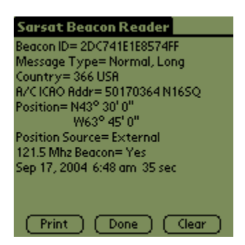
Example of 24-Bit Address Data View

The message will be automatically saved to a database for later review. Press "clear" or right arrow key to clear screen for next message.