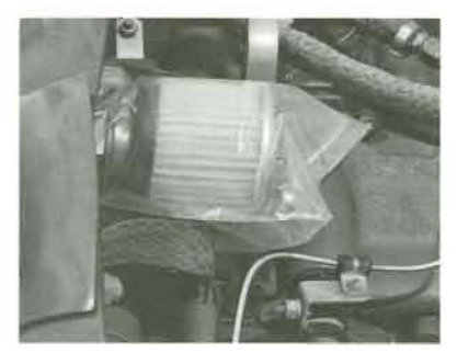
Fig. 2 Covered Inlet Filter