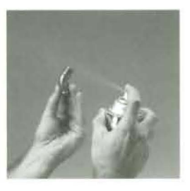
Fig. 6 Proper Spraying of Fitting