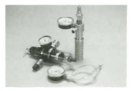
Fig. 3 343 Vacuum

The Airborne <u>343 Test Kit</u> can be used to safely troubleshoot vacuum systems (Fig. 3) and pressure systems (Fig. 4) in operation. For more detailed instructions about using the Test Kit for efficient problem diagnosis, see Airborne 343 Test Kit Instruction Manual. Testing can also be done while aircraft engines are running, however, safety and accuracy will be compromised.