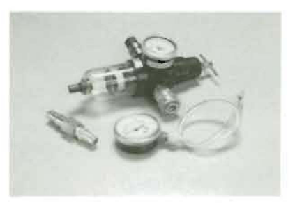
Fig. 4 343 Pressure