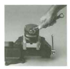
Fig. 7 Tightening Fitting with Wrench