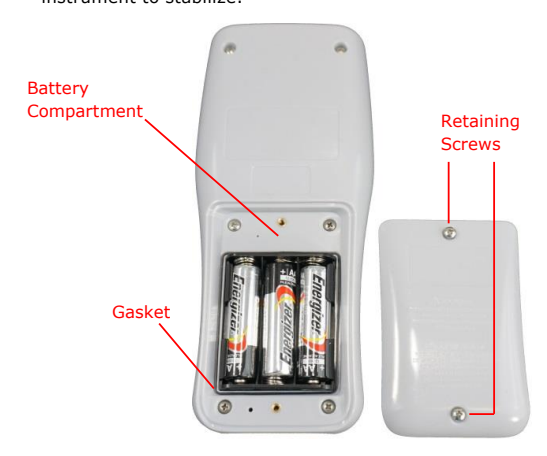
Figure 1: Battery Installation