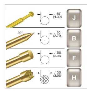
BKP Pin Options