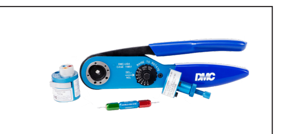
DMC1186 Electrical and Wiring System Tool Kit