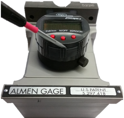
Figure 9. Open tray carefully with a flat blade screwdriver.