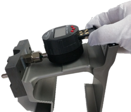
Figure 10. Grasp and pull the battery tray.