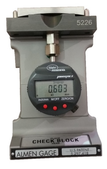
Figure 5. Place the curved side of the Curved Check Block on the gage