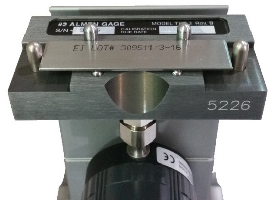
Figure 6. Unpeened Almen Strip