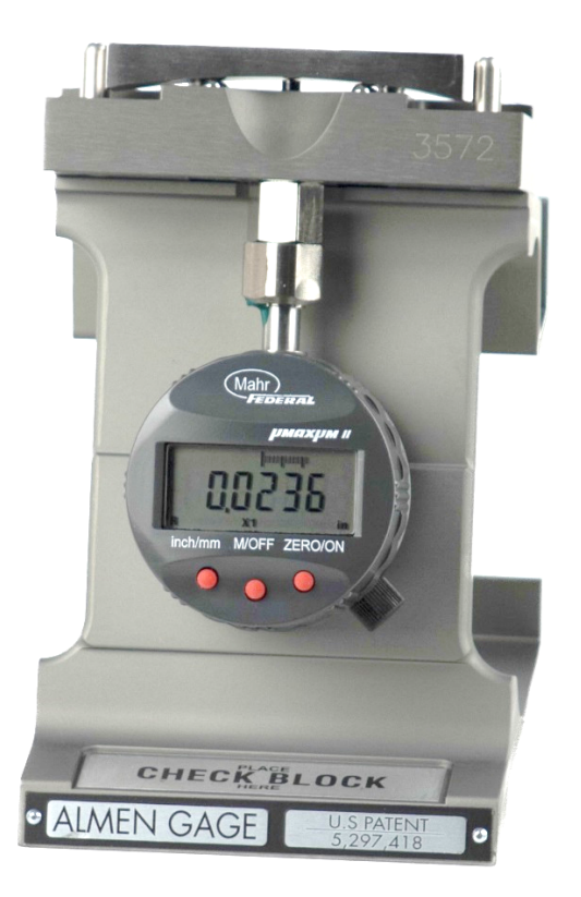
Figure 1 . Gage shown when in sitting position with Curved Check Block in measuring position (Display in inch mode).