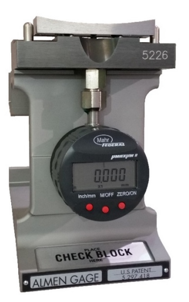
Figure 4. Place flat side of the Curved Check Block on the gage