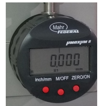
Figure 3. Red Control buttons

SAE J442 requires Almen gage indicators to have a resolution of 0.001 mm; therefore, the TSP-3 #2 Almen gage is factory set to display 0.000 mm, with a 0.001 mm resolution.