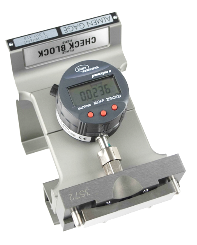
Figure 2 . Gage shown when in standing position with Curved Check Block in measuring position (Display in inch mode).

Figure 1 . Gage shown when in sitting position with Curved Check Block in measuring position (Display in inch mode).