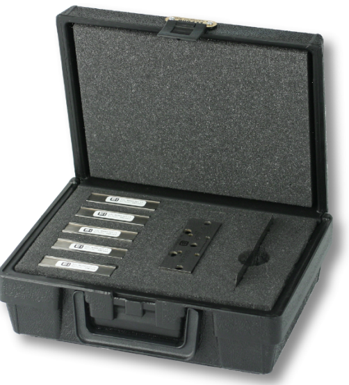
Figure 13. Almen Gage Calibration Kit El # 999430

See <u>www.electronics-inc.com</u> for more information.