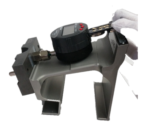
Figure 11. The batteries are held on the underside of the tray.