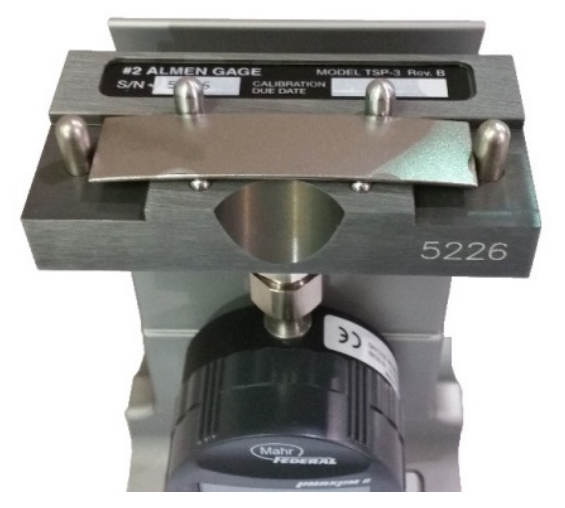
Figure 7. Place strip onto gage with indicator tip touching the non-peened side of strip