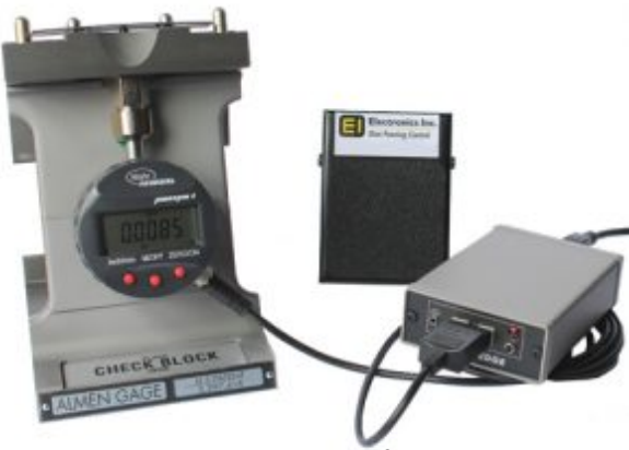
Figure 14. Computer Interface EI# 999144