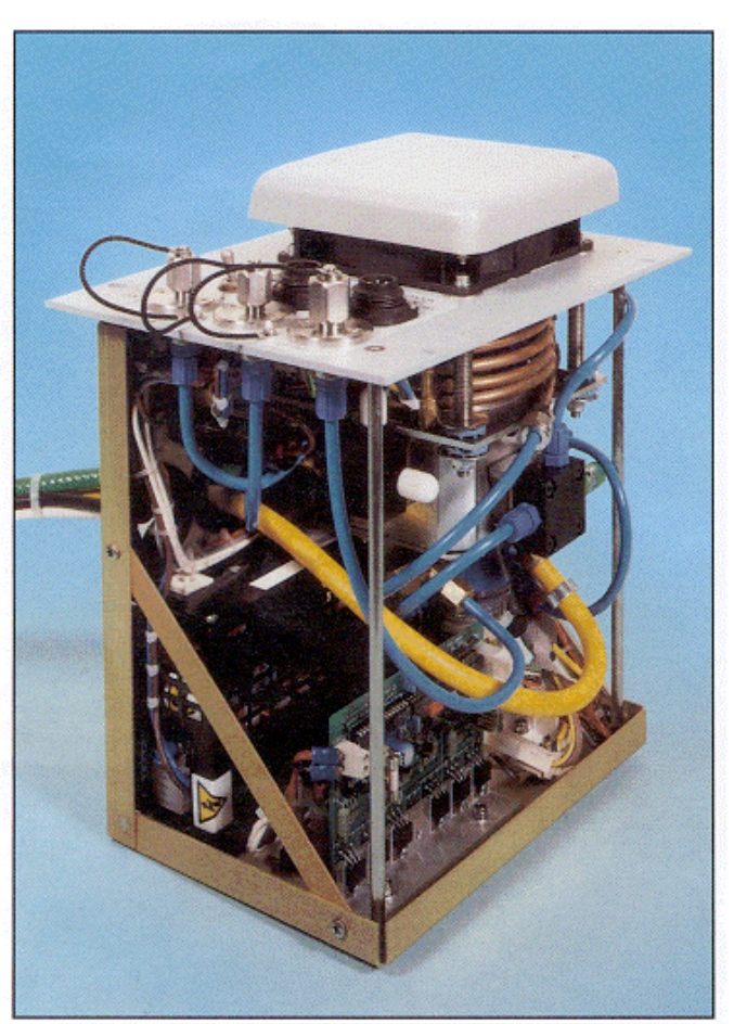
ADTS 405 F FLIGHTLINE PUMP

Druck have designed a rugged, long life pressure and vacuum supply unit for use with air data test systems.