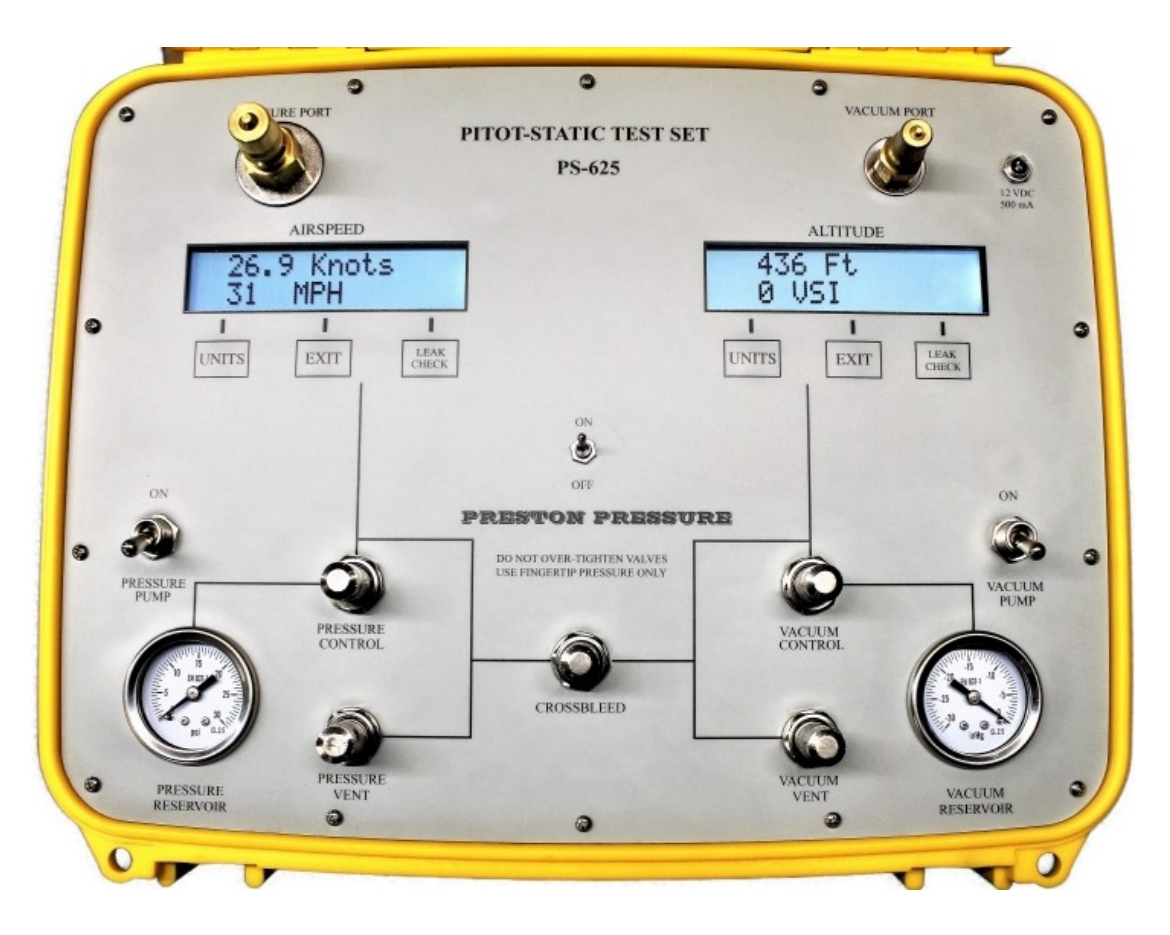
Front Panel Description

• The front panel Altitude buttons function as follows: