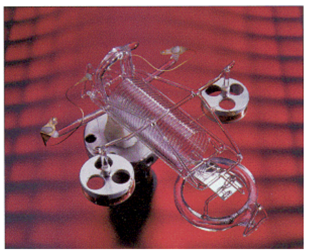
The Model 7010 features Ruska's own force balanced, fused-quartz Bourdon tube. No other transducer matches its performance: precision to 0.003% of full scale and stability to 0.005% of reading over six months.

Multirange systems - the Model 7010 can be configured in custom, multirange systems for a high level of performance over a wide pressure range. These multirange systems, which may include from three to eight separate controllers, provide single operator and computer interfaces and a common test port.