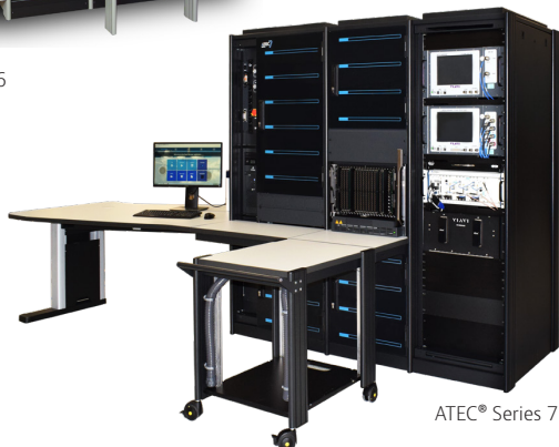
ATEC® Series 7