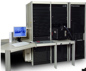
ATEC® Series 6

The RF instrumentation package includes PXI format synthetic instrument modules and the VIAVI NextGen bench test equipment.