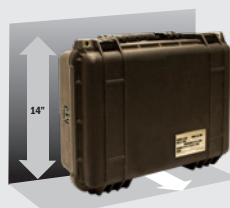
Under 18 lbs. (8 kg)