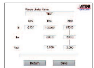
Typical screen display