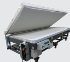
Vacuum Curing/Debulking Tables