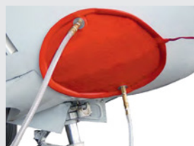
Composite Heating Blankets