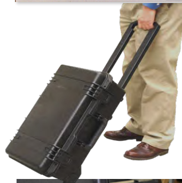
Easy to transport