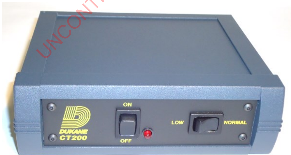
Figure 1. CT200 Precision Source