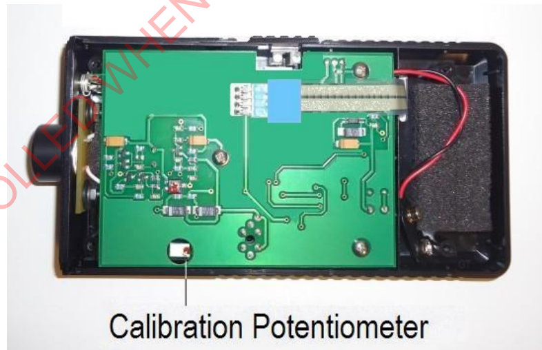
Figure 4. Calibration Potentiometer Location TS200 Shown

3.1.4. Adjust the calibration test potentiometer with the Adjuster Tool until the TS200 display reads 3.00V. Reassemble the TS200 housing and attach an approved calibration label. This completes the calibration.