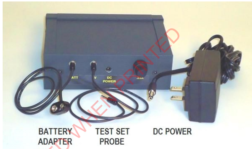
Figure 2. Rear View Test Set Probe Connection

Looking at the rear panel of the CT200, connect the Test Set Probe lead to the jack labeled 3V. Connect the Battery Adapter lead to the jack labeled BATT. Connect the DC power supply to the jack marked DC Power. See photo below.