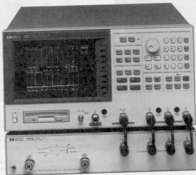
HP 4396A with HP 85046A