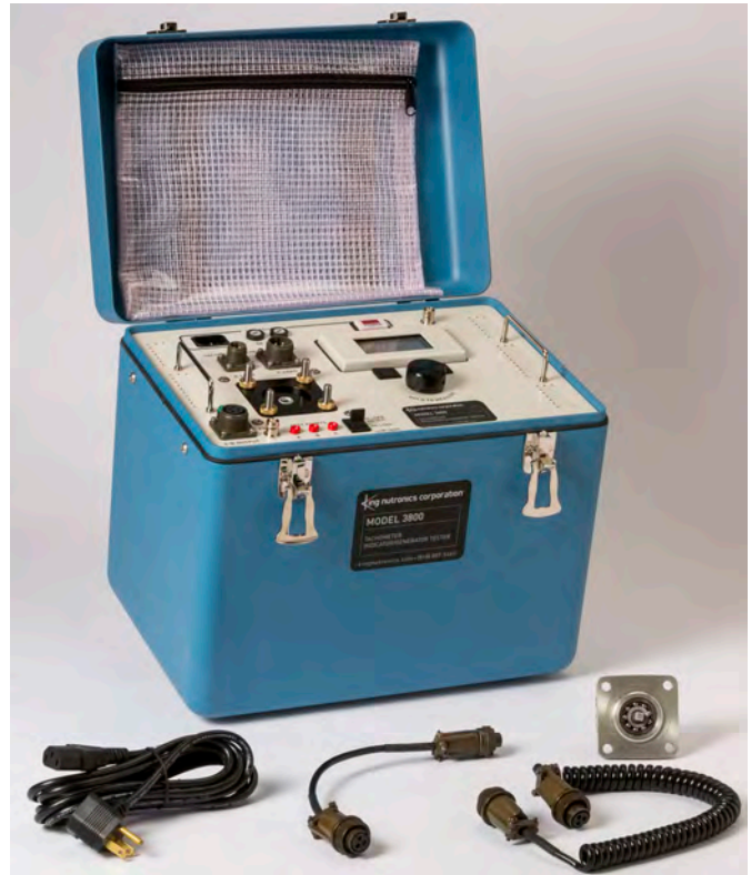
Tachometer Tester with Standard Accessories