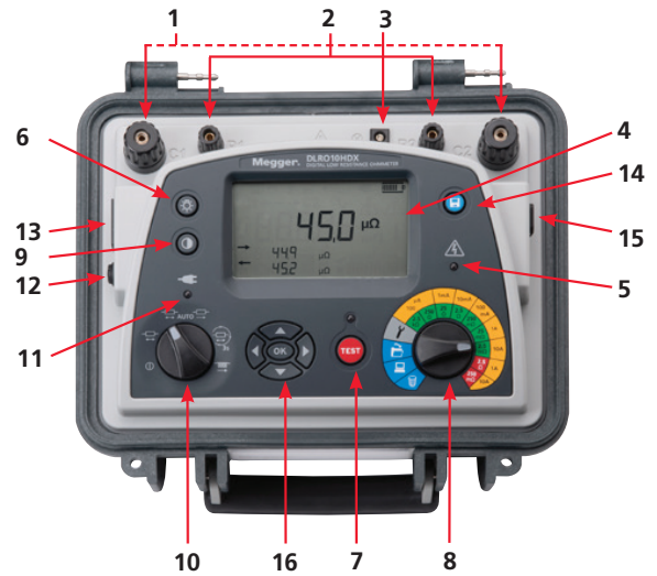
DLRO10HDX Instrument Overview