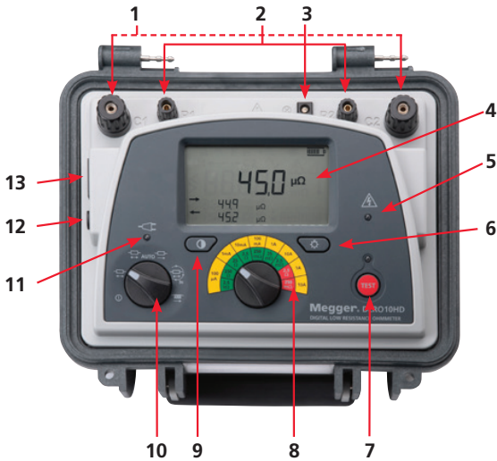
DLRO10HD Instrument Overview