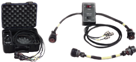
Large selection of aircraft specific interface cables available

Each aircraft platform requires a unique interface to access the FQIS. The complexity of the fuel system determines the capability of the interface to allow for complete testing of the fuel quantity system. Contact VIAVI for the proper interface for your aircraft.